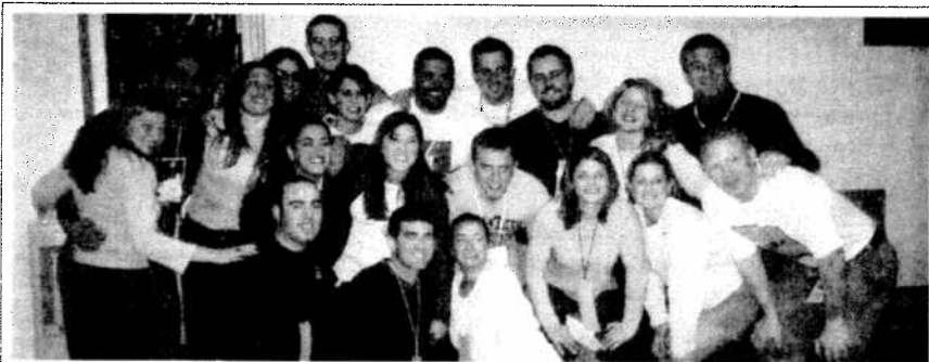
DMAIG members at Rec Hall before presenting their donation.

"It was a great way to spend some time with old friends, sneeze a few times, rub some butts (when is the last time you did that anyway?)"